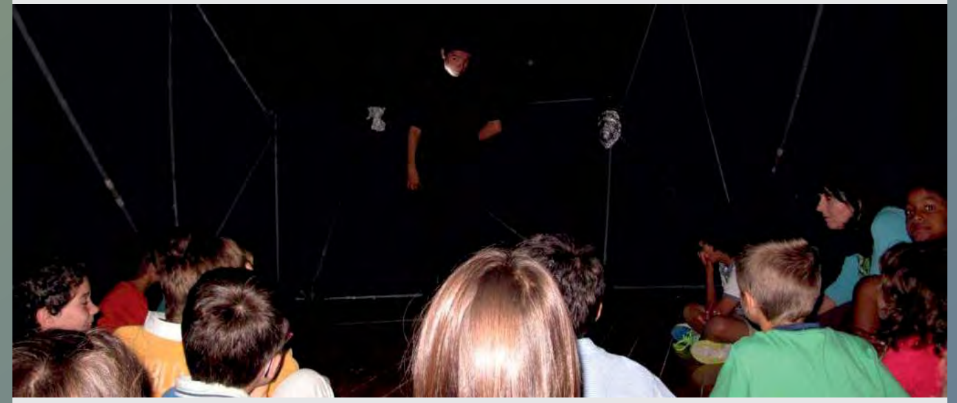
28-29 May – The play "Ores" brings children to the mine environment. This stage play appears under the thematic of the roadshow that passed through several parishes from the Idanha-a-Nova Municipality "When We Went for Ore...". The Stage Play "Ores" was presented by the Cultural Association "Fugir do Medo (Running from Fear)", within the scope of the Project "Fauna". The play took place with the audience sat in the middle of the stage, inside a "tent" with the shape of a mine adit. In the auditorium foyer was set up an exhibit called "When the sky is the ground that we step" also visited by students and teachers. Participated 17 students from the class B (2nd Grade), 19 students from the class F (4th Grade), 23 students from the class C (2nd + 3rd Grade), 25 students from the class D (3rd Grade) and 17 students from the class E (2rd + 4th Grade), followed by 5 professors.