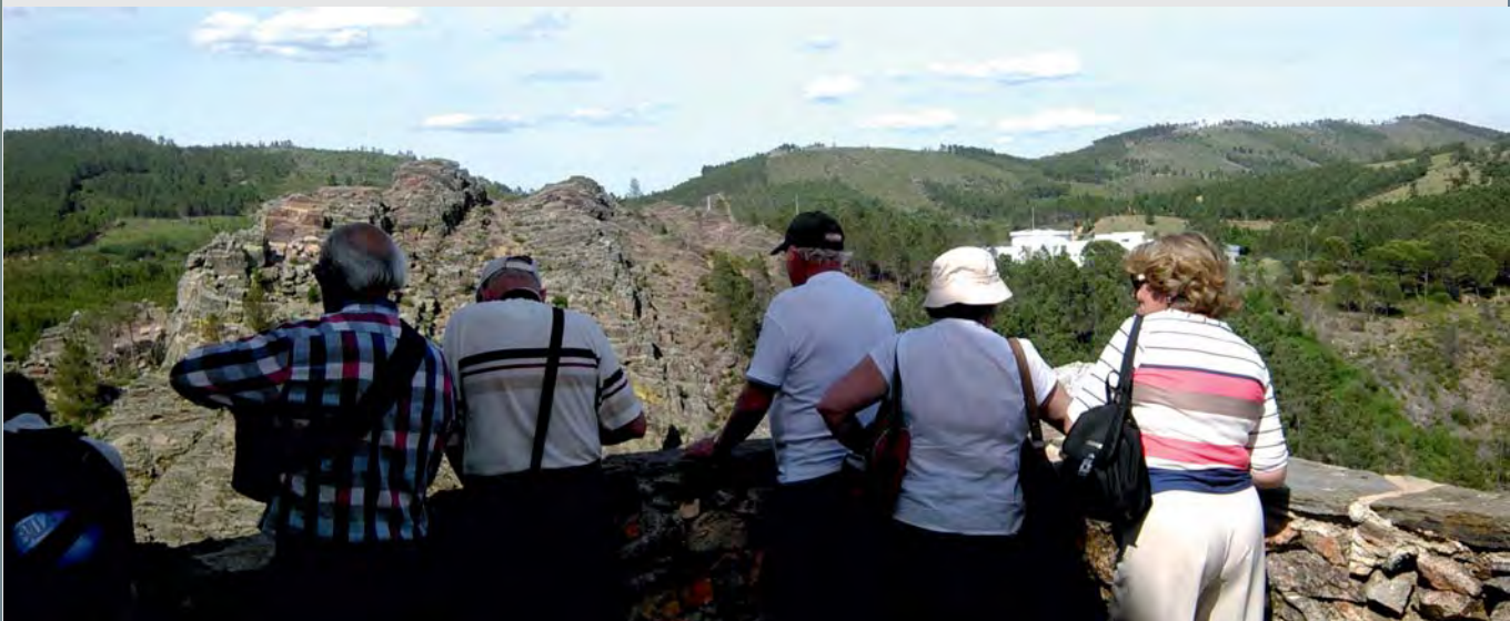
10 May – Seniors by train coming to the Geopark.

9-10 May – Visiting the Geopark. The outdoor company partner Actigeo guided 12 tourists across the Geopark. They visited Monsanto. The village of Monsanto provides a unique experience for those who visit it. Rises itself atop of the Monsanto granitic Inselberg, going down through narrow and winding streets to the foothill. Besides the splendorous granite houses, are highlighted as touristic attractivs the Templar Castle, the Mercy Church, the Tower of Lucano and the Romanesque Church of S. Miguel. They also relaxed in Termas de Monfortinho. The thermal waters that sprout here are a source of health and well-being, providing a harmonious and relaxing experience. On the next day the visit continued through Penha Garcia, in the Ichnological Park where they discovered the testimonies left by Trilobites in this valley which, until 500 million years ago, was an ocean full of biodiversity. Afterwards they left to Proença-a-Velha where they pass through the Olive Oil Pole Presses of Proença-a-Velha. Here they learned the technics and traditional technologies of the olive production, so typical in the Mediterranean diet and so well recognized throughout the world by its high quality. There was still time to stroll by the Festival of Soups.